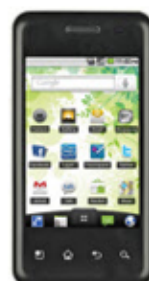
LG Optimus Chic