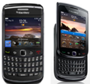
BLACKBERRY TORCH & BOLD 9780